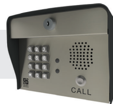
EDGE E1 + INTERCOM Keypad w/ Intercom 27-215

For more information, visit us online: securitybrandsinc.com