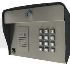
EDGE E1 Keypad 27-210