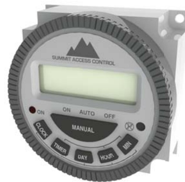
S-T24 24-VAC/DC TIMER