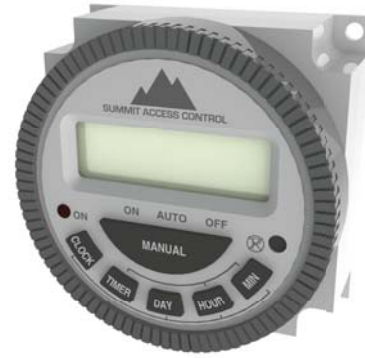
S-T12 12-VDC TIMER