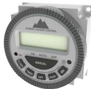
S-T110 110-VAC TIMER